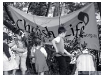
Kids at play retrieving the ball from the mangroves