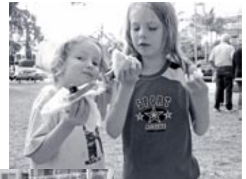
"World's cutest nieces" according to the photographer (uncle)