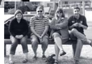
Big kids relaxing